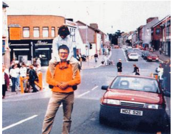
This snapshot of a Spanish visitor to Omagh was taken seconds before the car on the right exploded. The girl's face was blanked out by the police before they released the photo.